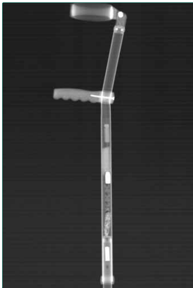
Walking crutch showing contraband hidden inside.

To assist in the identification of foreign objects, human anatomical features are de-emphasized in the displayed images. This has the additional advantage of protecting the dignity of the individual being scanned. The display software comes standard with several image enhancement functions to further assist identification of suspect items. The display system is designed such that the viewing monitors can be located remotely from the scanning booth. This not only contributes to the protection of the scanned subject's privacy but also decreases