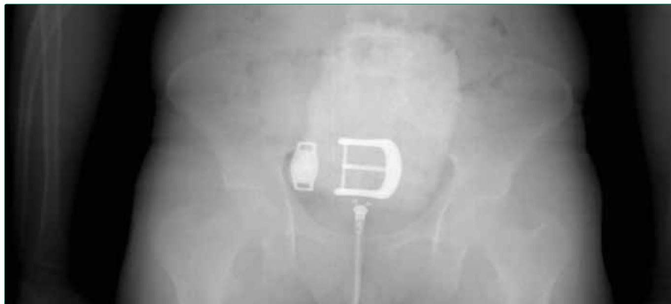
Two dimensional image of contraband strapped to the body.